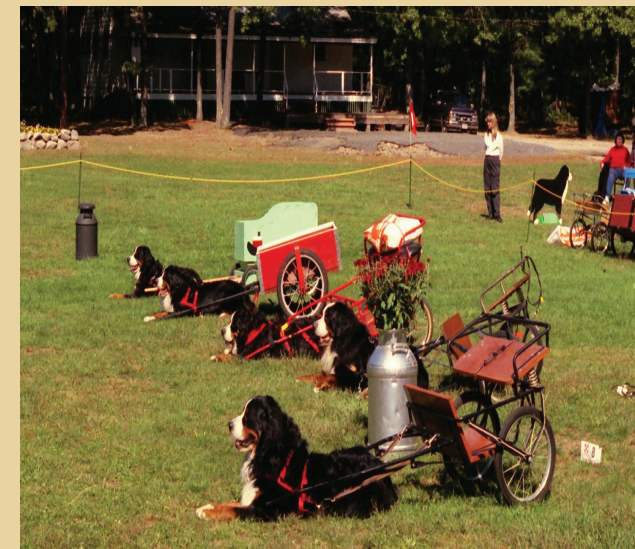
September 22, 1991: Berners wait patiently during the group-stay, hitched to a wonderful variety of carts. The dogs could be left standing, sitting, or lying down at the handler's discretion. This exercise is still part of the current draft test. Any exhibitor will tell you this is the longest three minutes in the world.